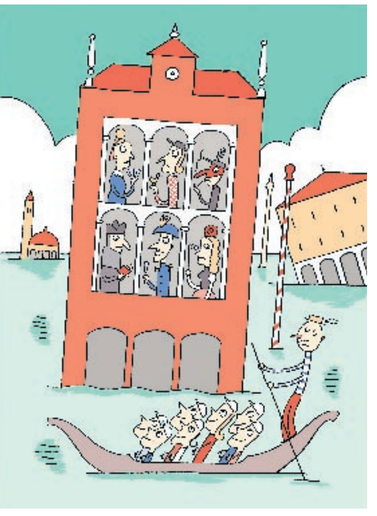
Since the great flood, Venetians have rebuffed nearly every attempt to rescue their fetid waterways, crumbling alleys, and priceless art.

affected them today. The Mayor, a philosopher and a man of the left, often blames Venetian troubles on the West's craven need for memorabilia, and has commissioned an advertising campaign that will feature rats, dead pigeons, and canals cluttered with refuse—all in an attempt to beat back the hordes who invade the city by water every day, only to withdraw by nightfall. "Venice needs intelligent visitors, not the tourists who assault it, who run in, grab what they want, and run out again," Cacciari said in May when he described the new campaign, which has been put together