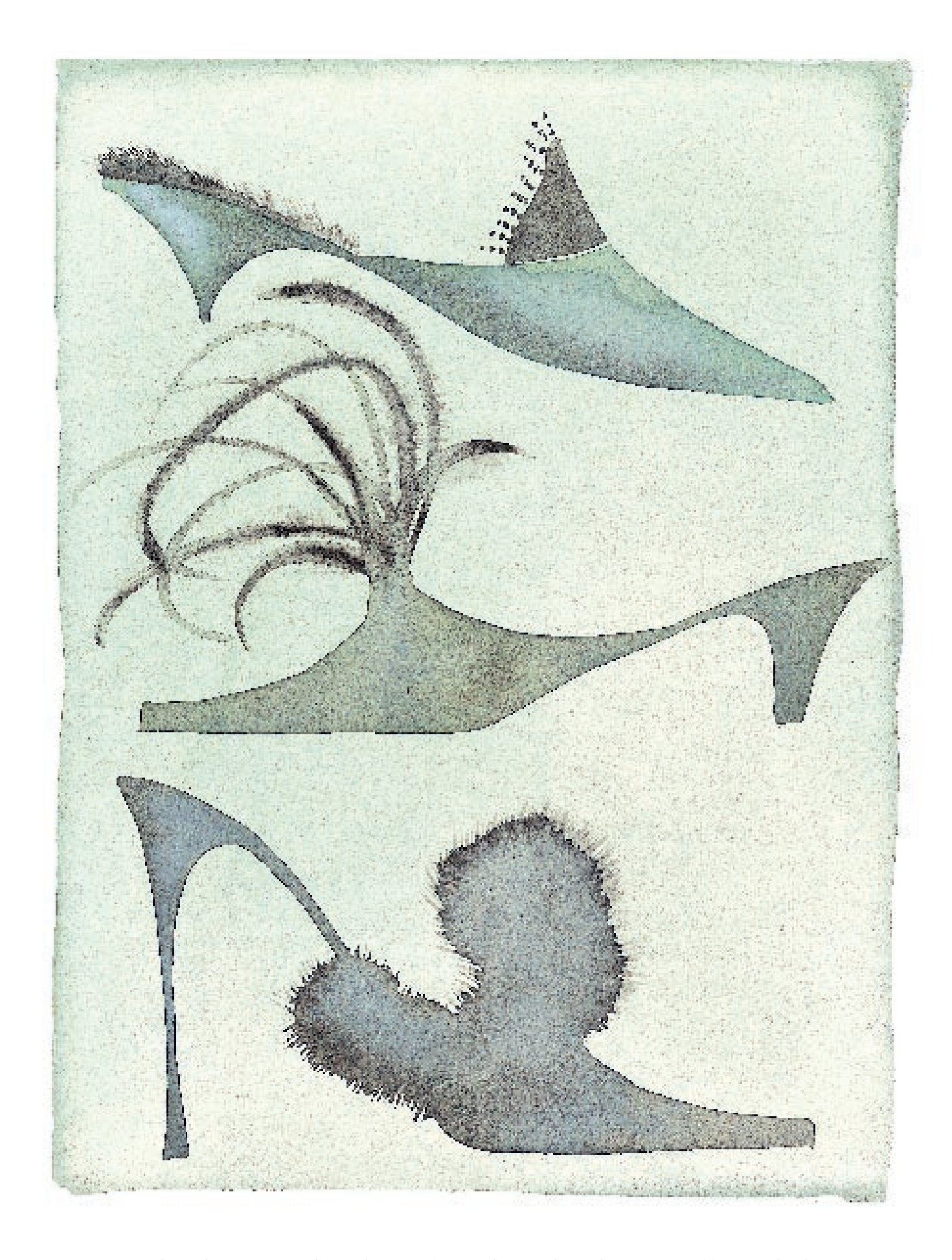
From \ the \ Blahnik \ archives, shoes \ embellished \ with \ beads, feathers, silk \ embroidery, silver \ mesh, \ wolf fur, \ and \ chinchilla.