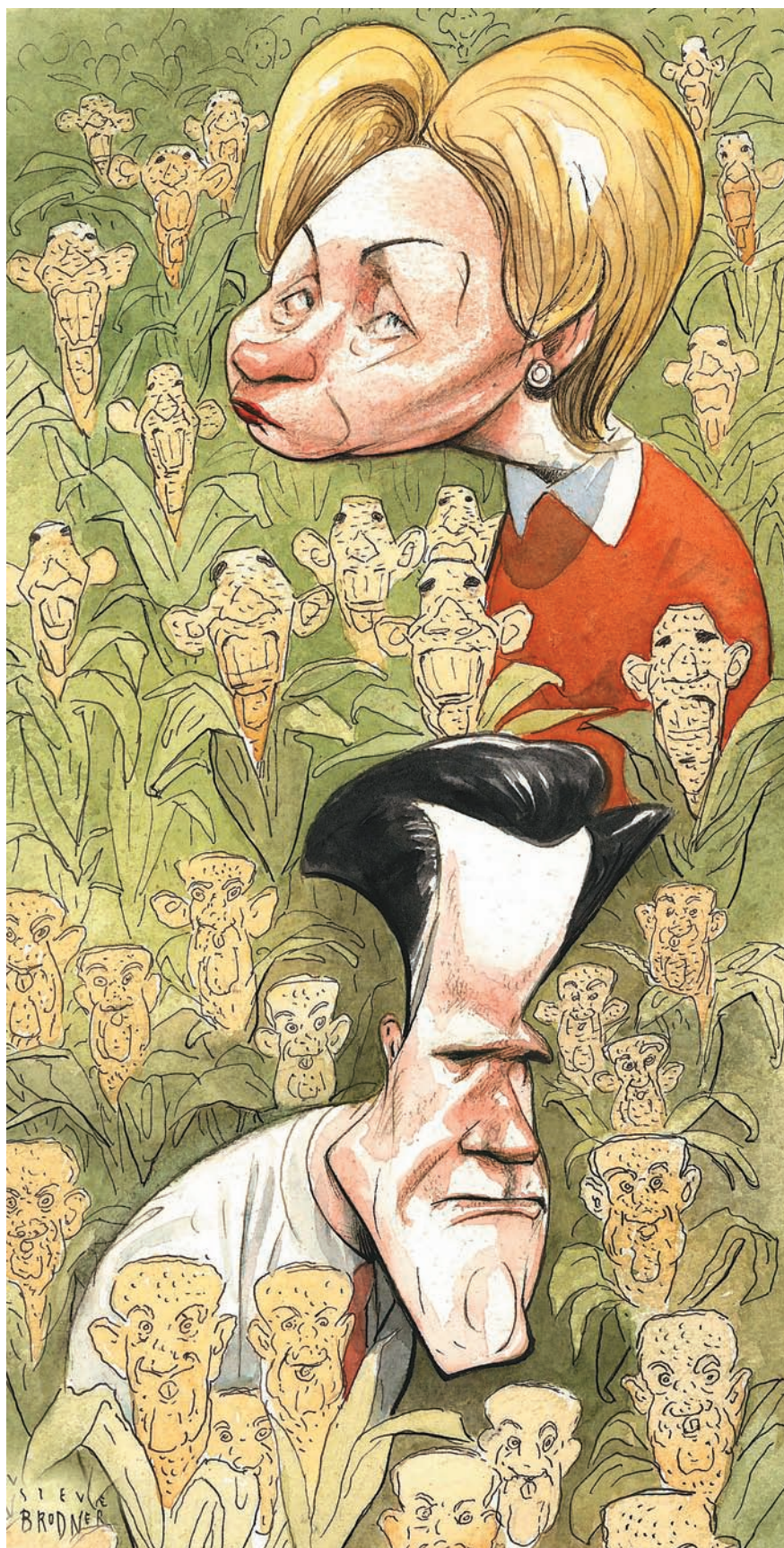
Hillary Clinton and Mitt Romney, who hope for a rich harvest in Iowa, find themselves in the tall corn with Barack Obama and Mike Huckabee.