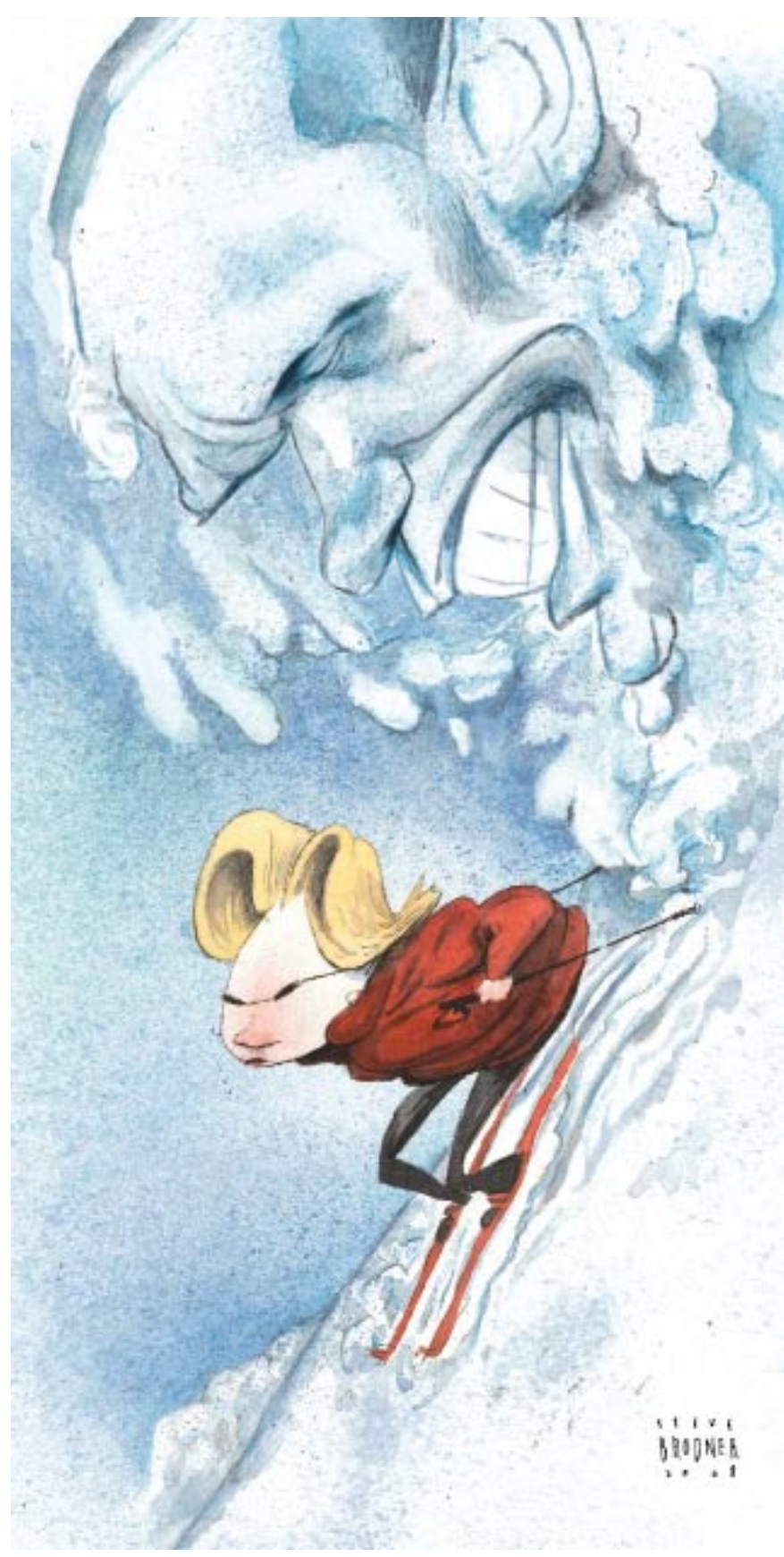
Ski Wisconsin! Buy lift tickets online and save! Avalanche or snow job, experience shows that the time to act with fierce urgency is now—on Day One!