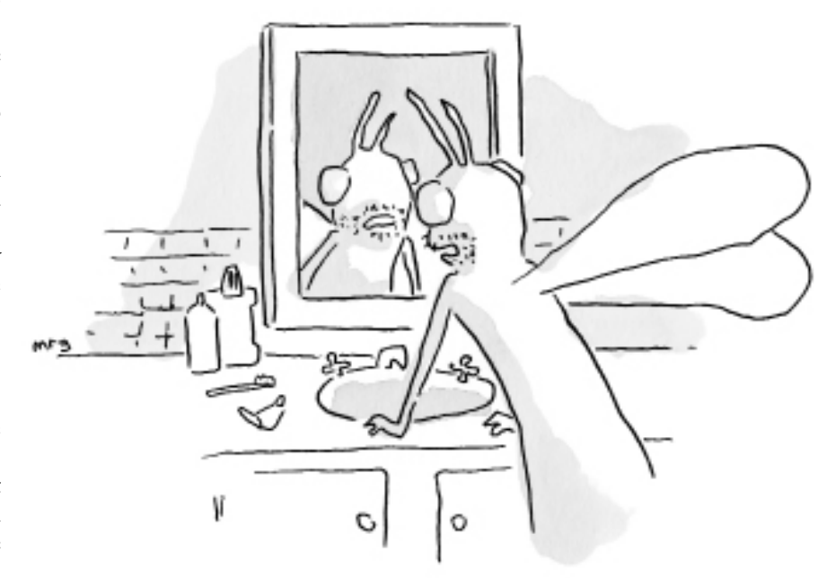
"I've got a wife, kids, a career—Jesus! I'm twelve hours old! How did this happen to me?"

unlikely to stop shopping. Economies won't stand still, either; those of China and India are expanding so speedily that people often ask whether sacrifices anywhere else can even matter.