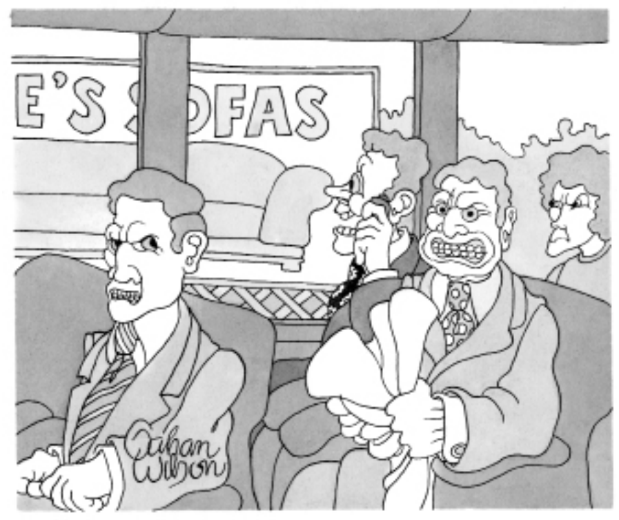
"Now we're passing by a great big sign urging us to buy sofas!"

Many factors influence the carbon footprint of a product: water use, cultivation and harvesting methods, quantity and type of fertilizer, even the type of fuel used to make the package. Sea-freight emissions are less than a sixtieth of those associated with airplanes, and you don't have to build highways to berth a ship. Last year, a study of the carbon cost of the global wine trade found that it is actually more "green" for New Yorkers to drink wine from Bordeaux, which is shipped by sea, than wine from California, sent by truck. That is largely because shipping wine is mostly shipping glass. The study found that "the efficiencies of shipping drive a 'green line' all the way to Columbus, Ohio, the point where a wine